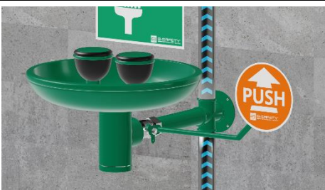
BR 300 4X5