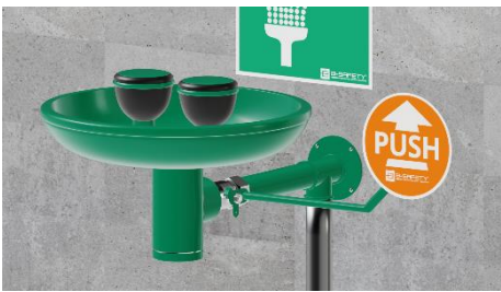
BR 300 0X5